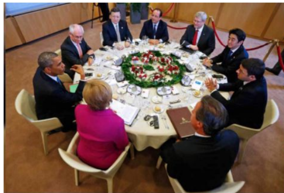
G7 summit meeting in Germany, 2015

© JUNE 10, 2015 POL PINOY LEAVE A COMMENT